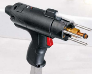
SMART LED LIGHT