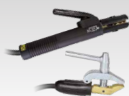
MMA kit 500A - 4 m - 50 mm 2 047419