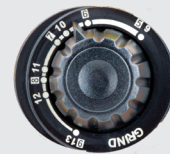
Shade 5 > 13 and grinding mode