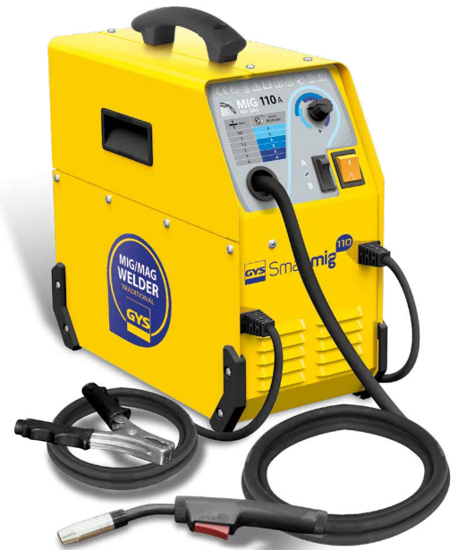
Supplied with an earth cable and a 2.2m fix torch.

1 process: NO GAZ for outdoor welding. Ø Wire 0,9 mm (kit no gas : 041240)