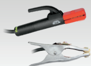
MMA kit 300 A - 4 m - 35 mm 2 038295