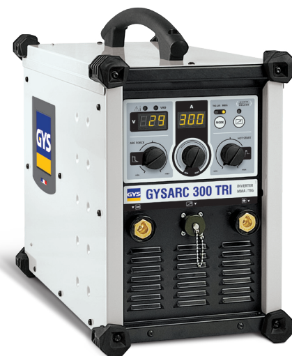
Supplied without accessories